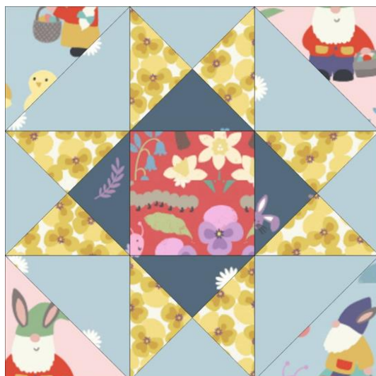
Block 2 diagram

Make up block 2 the same way as block 1. Sew 8 blocks in total