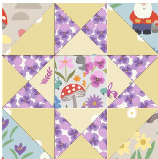
Block 2 diagram

Make up block 2 the same way as block 1. Sew 8 blocks in total