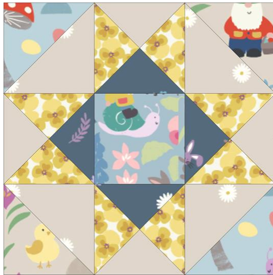
Block 1 diagram

Lay out the fabric pieces for the block. Sew the two larger triangles together to make a square.