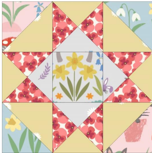
Block 1 diagram

Lay out the fabric pieces for the block. Sew the two larger triangles together to make a square.